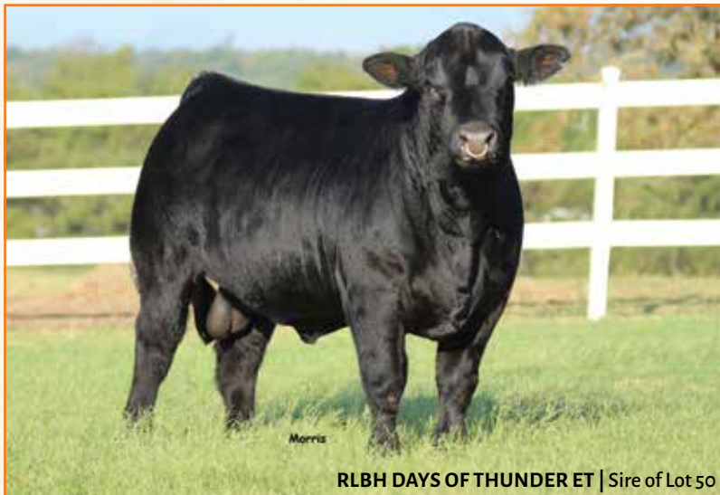
RLBH DAYS OF THUNDER ET | Sire of Lot 50