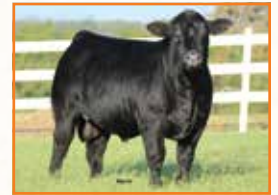
RLBH DAYS OF THUNDER ET