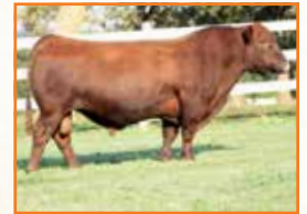
WEBR MAXED OUT 627