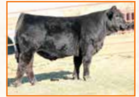
LVLS CARTEL 1023C

DAMERON FIRST CLASS x SILVEIRAS SARAS DREAM 1339