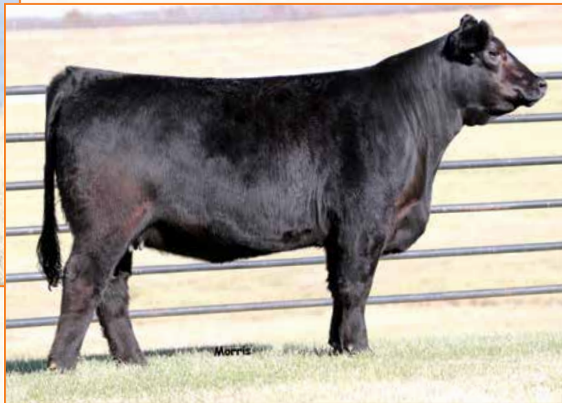
AUTO AJAY 206A | Dam of Lots 20 & 21