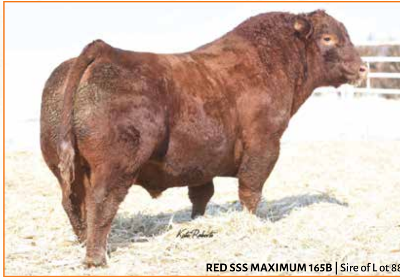
RED SSS MAXIMUM 165B | Sire of Lot 88