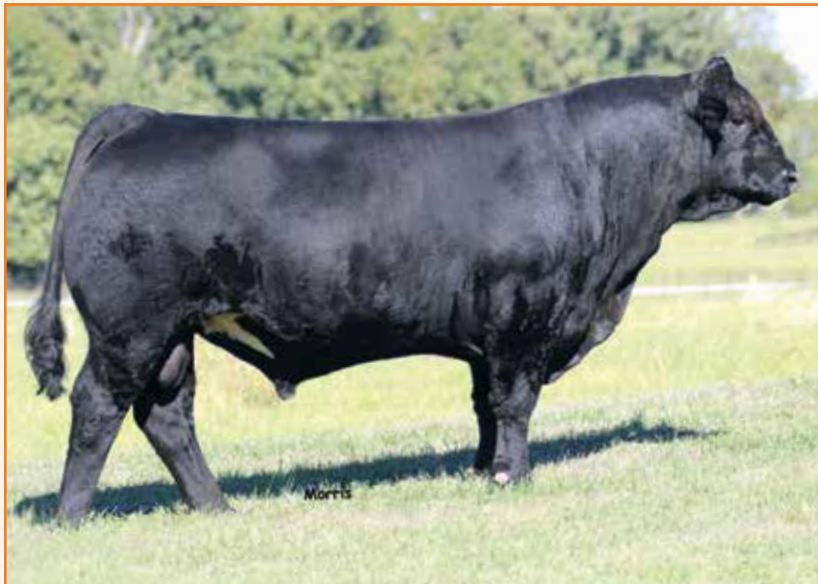
AUTO CRUZE 132X | Sire of Lot 22