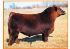
MR POKER FACE 7862