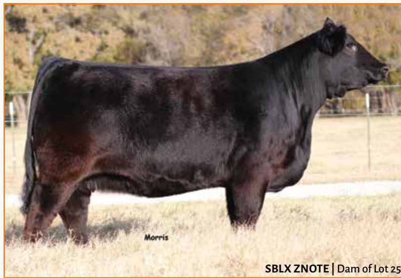
SBLX ZNOTE | Dam of Lot 25

PBRS Heat 0154H is a daughter of AAR Ten X 7008SA out of SBLX Znote, a daughter of MAGS Xyloid and MAGS Manuela. She ranks in the 15th percentile for both her birthweight and marbling figures. Folks, a Lim-Flex pedigree doesn't get more elite than this female's. She's deep sided, long in her spine and expressively muscled. On the move, she takes a large, confident stride with added flexibility off both ends. This is an exciting donor prospect and we are confident you'll be pleased with the profitability and marketability this female will bring to your program.