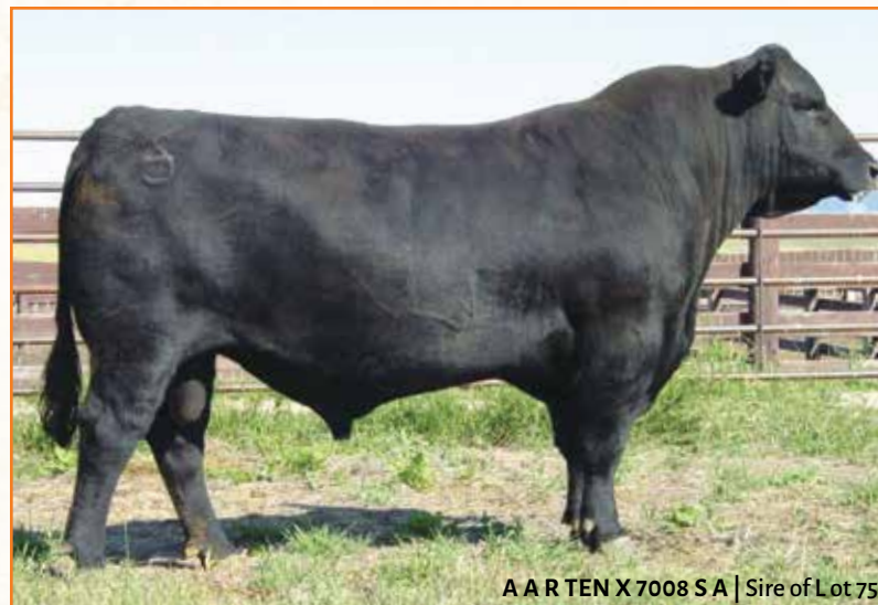
A A R TEN X 7008 SA | Sire of Lot 75

PBRS Banknote 035 is a 43% Lim-Flex son of Brooking Bank Note 4040, a son of Connealy Earnan 076E. His dam is SBLX Znote, the daughter of MAGS Xyloid and MAGS Manuela. This bull is long sided, thick topped and incredibly athletic on the move. He maintains a powerful presence from every angle and has plenty of meat and potatoes to sire an elite calf crop. This bull's marbling figure ranks in the 30th percentile of the breed.