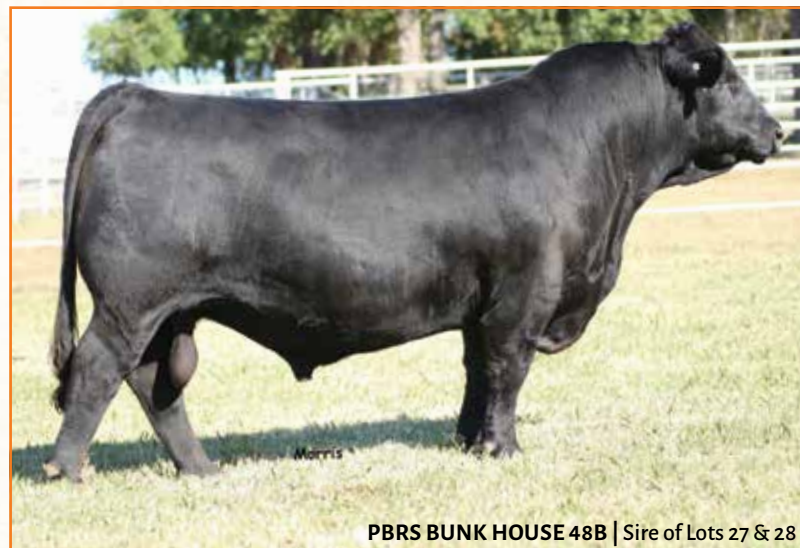
PBRS BUNK HOUSE 48B | Sire of Lots 27 & 28

AI'd 04.21.21 to MAGS Good Will 130G (43% HP/HB son of AHCC Dakota Thunder) PE'd 04.21.21 to 08.15.21 to MAGS Good Will 130G (43% HP/HB son of AHCC Dakota Thunder) PBRS Handcrafted 043H is a double homozygous daughter of PBRS Bunkhouse 48B. Her dam is PBRS 8136F, a female sired by LVLS Cartel 1023C, a son of EF Zen 344Z. On paper, this female ranks in the 25th percentile for her yearling weight figure.