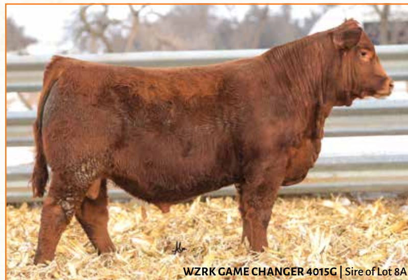
WZRK GAME CHANGER 4015G | Sire of Lot 8A

LOT 8A: PBRS 1235J, 62.5% Lim-Flex, double polled, red heifer calf born 9.18.21, sired by WZRK Game Changer 4015G, (NPM2161929), BW: 70 lbs.