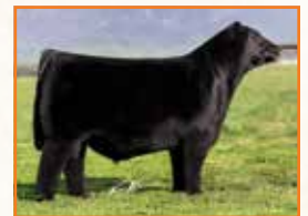
COLBURN PRIMO 5153