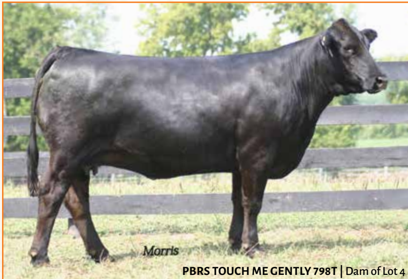
PBRs TOUCH ME GENTLY 798T | Dam of Lot 4