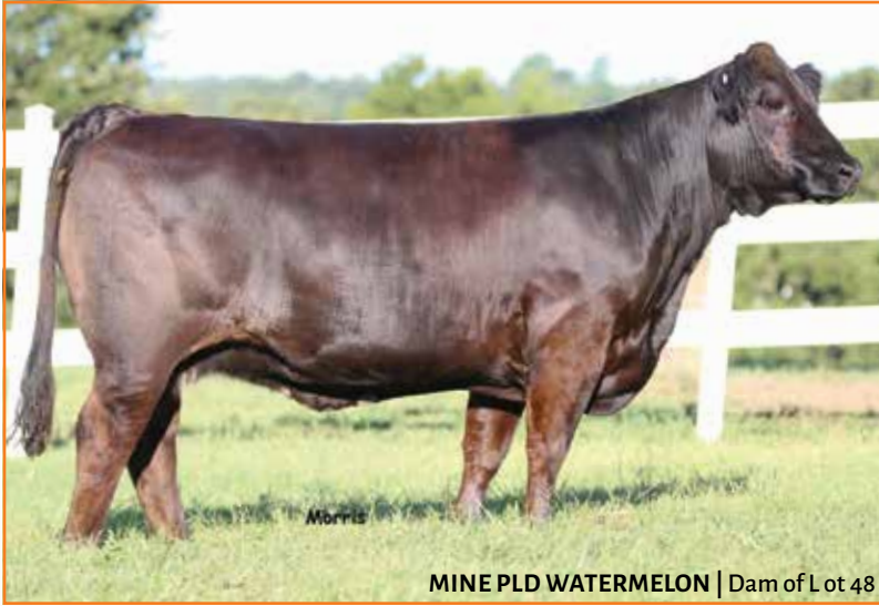
MINE PLD WATERMELON | Dam of Lot 48