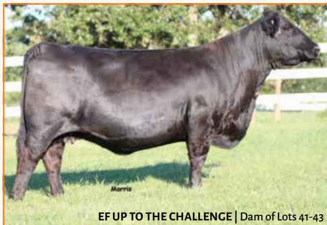
EF UP TO THE CHALLENGE | Dam of Lots 41-43