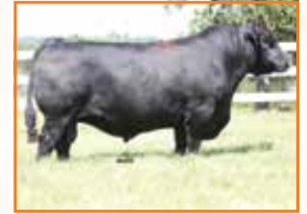
PBRs MILESTONE 137Y