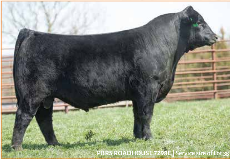
PBRs ROADHOUSE 7298E | Service sire of Lot 33