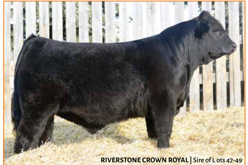
RIVERSTONE CROWN ROYAL | Sire of Lots 47-49

PBRs 9352G is a 73% Lim-Flex daughter of Riverstone Crown Royal. Her dam is PBRs All In White 323A, a female sired by LH U Haul 135U. She ranks in the 25th percentile for her birthweight figure. You've heard it before and you'll continue to hear it for many years to come—Crown Royal daughters are a true force to be reckoned with and so is this female. She is attractively patterned, smooth shouldered and structurally correct. Don't let this gal slide by, you'll be seeing more of her in the near future.