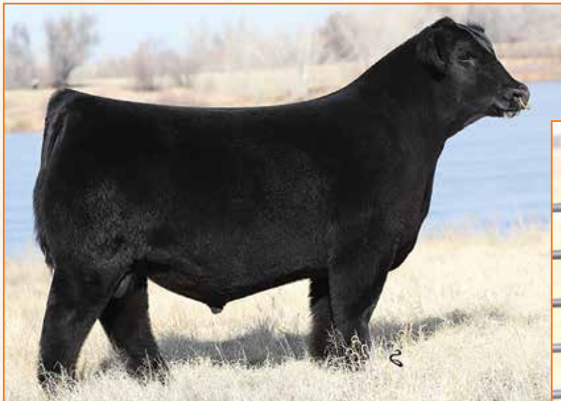
GATEWAY FOLLOW ME F163 | Sire of Lot 20