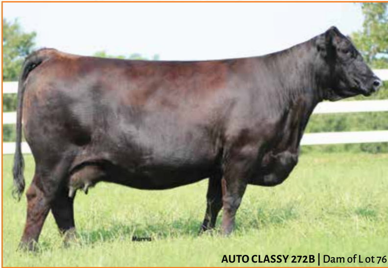
AUTO CLASSY 272B | Dam of Lot 76