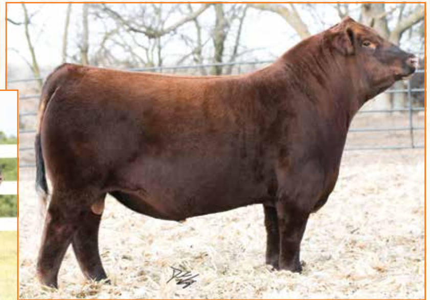
MAGS GOOD WILL 130G | Service sire to many lots selling.