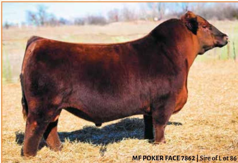
MF POKER FACE 7862 | Sire of Lot 86