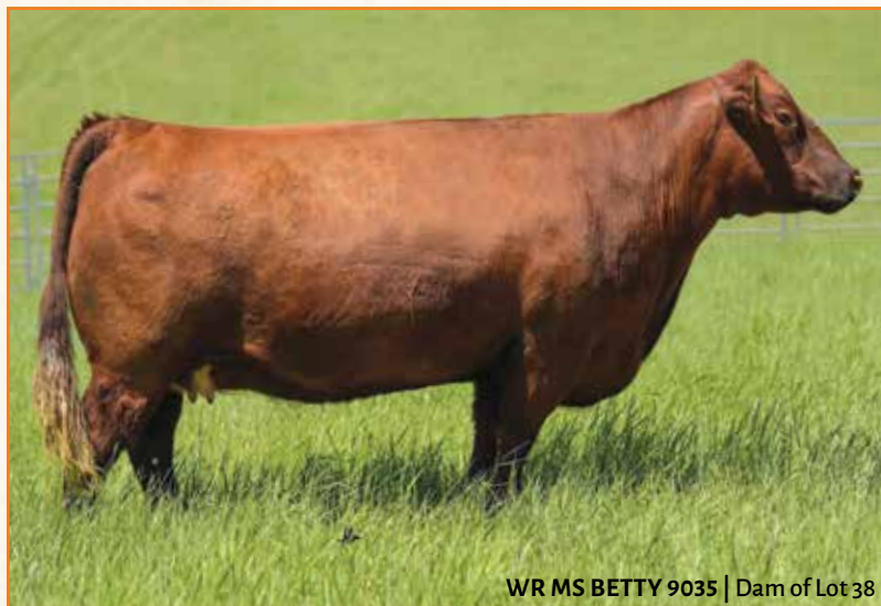
WR MS BETTY 9035 | Dam of Lot 38