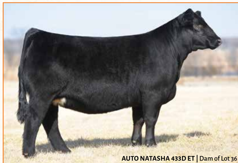
AUTO NATASHA 433D ET | Dam of Lot 36

AI'd 04.10.21 to MAGS Good Will 130G (43% HP/HB son of AHCC Dakota Thunder) PE'd 04.10.21 to 08.15.21 to MAGS Good Will 130G (43% HP/HB son of AHCC Dakota Thunder) PBRS Natasha 03H is a daughter of RLBH Days of Thunder. Her dam is AUTO Natasha 433D, a female sired by AUTO Cruze 132X and out of the influential PBRS Dutches 790X female. We certainly do appreciate the RLBH Days of Thunder females around here and this female is no exception. PBRS Natasha 03H is an attractively made female with added depth of body and overall dimension. You can't go wrong with introducing a female of this worth into your herd. This female is homozygous polled.