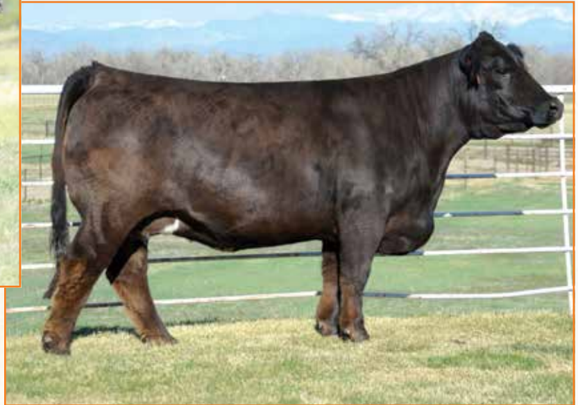
MAGS UAHUKA | Dam of Lot 22