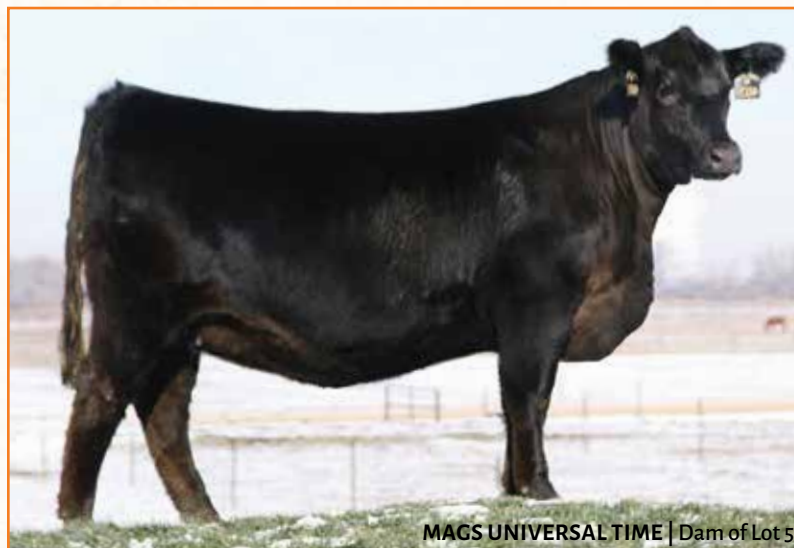
MAGS UNIVERSAL TIME | Dam of Lot 5

LOT 5A: PBRs 1195J, 59% Lim-Flex, double polled, homo black, bull calf born 9.3.21, sired by MAGS Good Will 130G (LFM2156961), BW: 71 lbs.