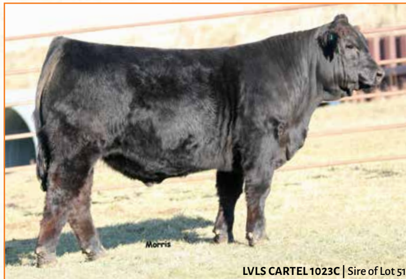
LVLS CARTEL 1023C | Sire of Lot 51

PBRs 9331G is a 67% Lim-Flex daughter of LVLS Cartel 1023C, a son of EF Zen 344Z. This female ranks in the 15th percentile for her milk figure and in the 30th percentile for her marbling figure.