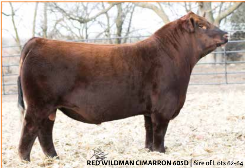
RED WILDMAN CIMARRON 605D | Sire of Lots 62-64