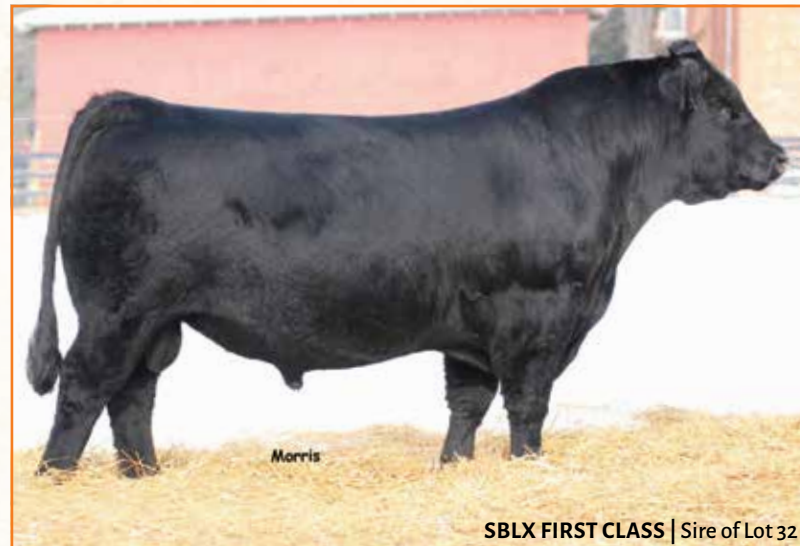
SBLX FIRST CLASS | Sire of Lot 32

AI'd 05.27.21 to PBRS Roadhouse 7298E (50% HP/HB son of MAGS Yip) PE'd 05.27.21 to 08.15.21 to MAGS Good Will 130G (43% HP/HB son of AHCC Dakota Thunder) PBRS Hopeful 055H is a 25% Lim-Flex daughter of SBLX First Class, the son of Dameron First Class and MAGS Manuela. This female's dam is Buford Eisa Evergreen 306Z, a daughter of BOHI Traveler 6134. On paper, she ranks in the 20th percentile for her marbling figure. She is homozygous black.