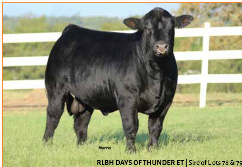
RLBH DAYS OF THUNDER ET | Sire of Lots 78 &amp; 79