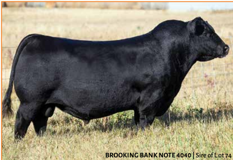
BROOKING BANK NOTE 4040 | Sire of Lot 74