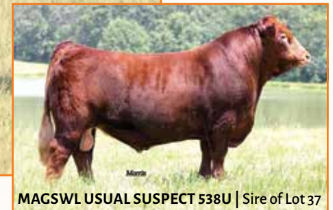
MAGSWL USUAL SUSPECT 538U | Sire of Lot 37