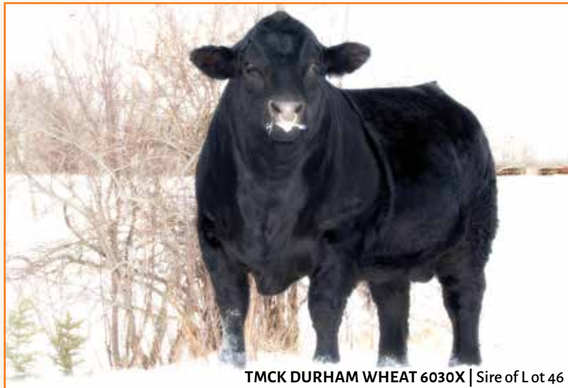
TMCK DURHAM WHEAT 6030X | Sire of Lot 46