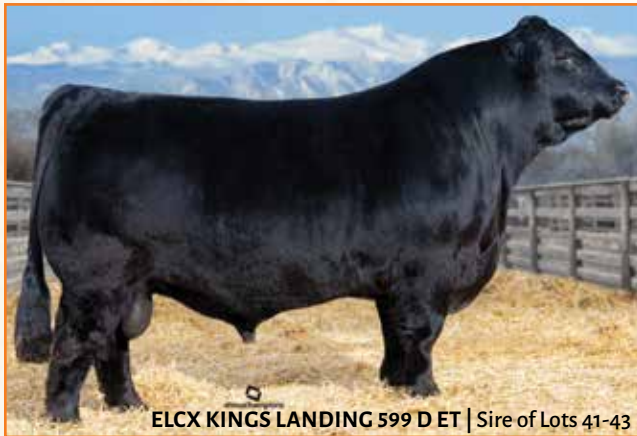
ELCX KINGS LANDING 599 D ET | Sire of Lots 41-43