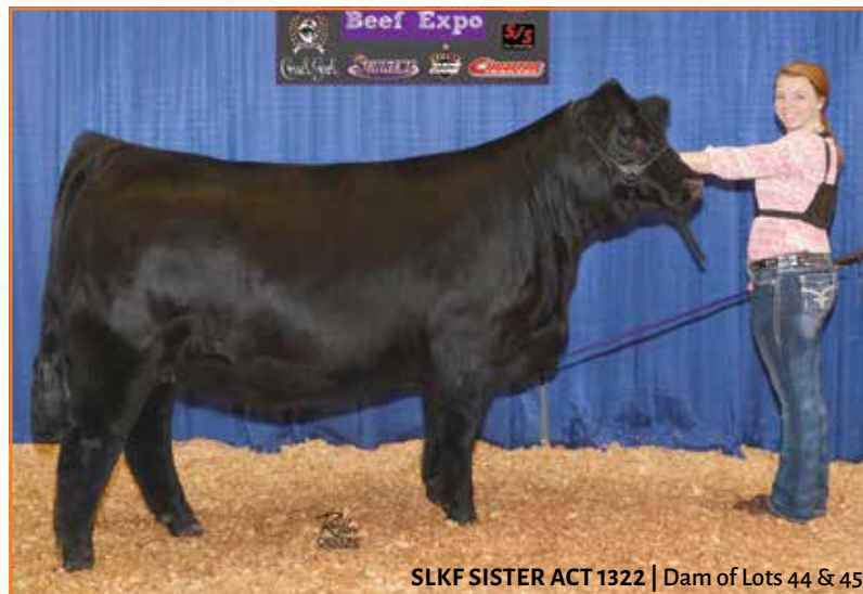
SLKF SISTER ACT 1322 | Dam of Lots 44 & 45

PBRs Green 9346G is a 43% Lim-Flex daughter of Colburn Primo. Her dam is SLKF Sister Act 1322, a female sired by DJ Xplosive, a son of DHVO Deuce 132R. She is a full sister to the impressive PBRs Gina 9343G. This female is homozygous polled.